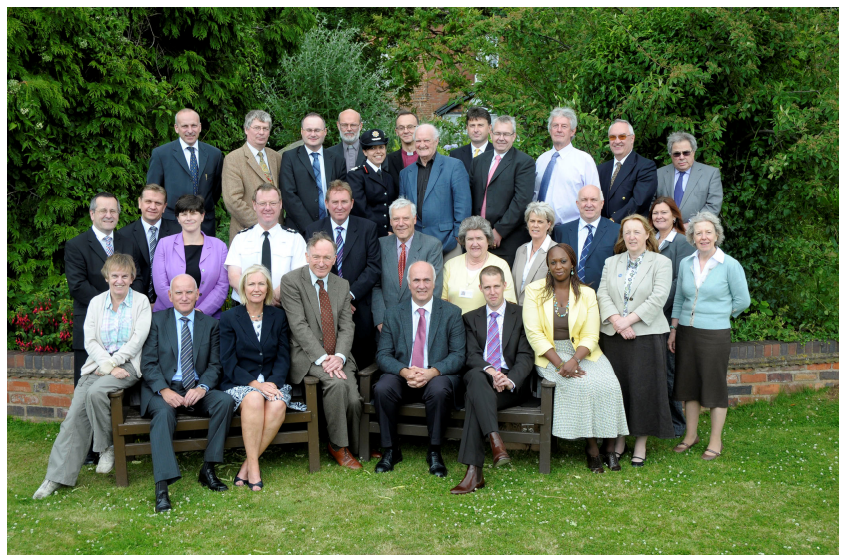
(Above: picture of all members of the Worcestershire Partnership)

The Worcestershire Partnership could be seen as the most influential board in the county.